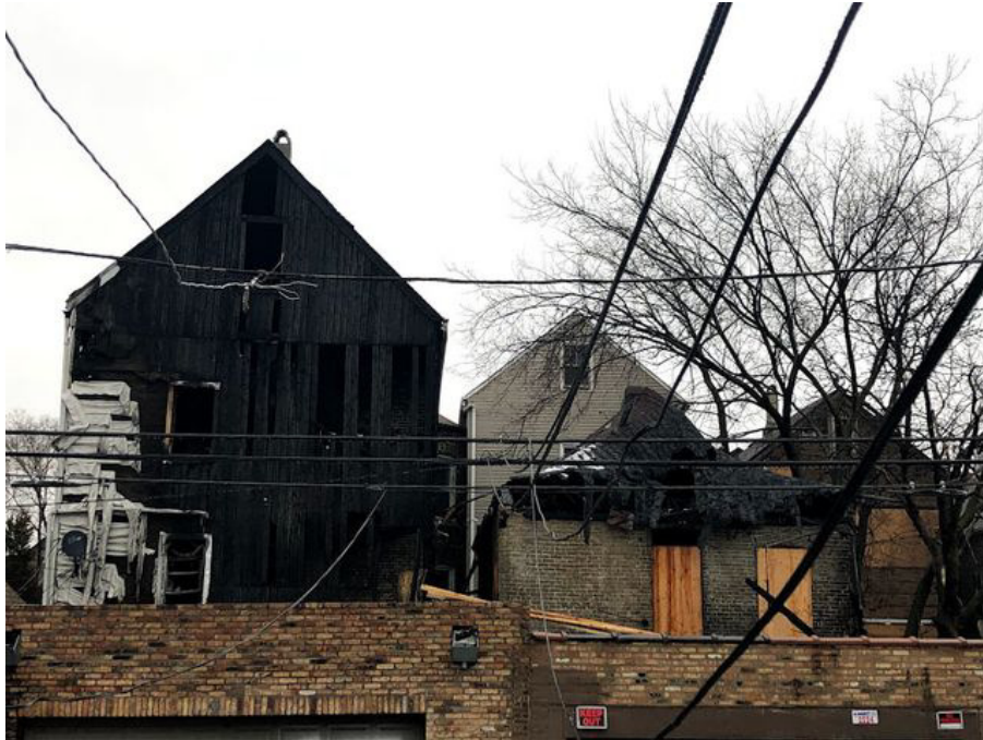
The coach house on the right, where the children slept

“It was about an hour after the fire was doused that we heard that people died. I saw the firefighters carrying stretchers out. We thought it was someone. After the fire they were just trying to clear everything out. The police came about three hours later. I did an interview with the police. They thought the fire was caused by arson.”