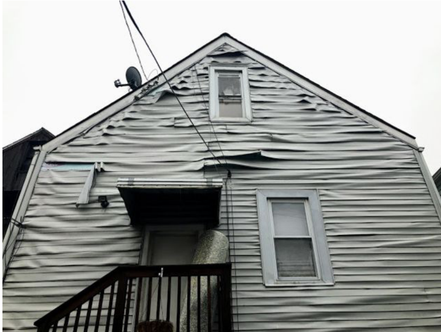
The melted siding

He added, “66 percent of all residential fires are caused by electrical fires. I was more afraid I would get electrified. When the building did burn, my first thought was electricity. How you can immediately rule out electricity when the fire has burned the electric lines, the transformer is destroyed, the building is in such shape that it is nothing but burnt up carbon and you can go in there one hundred percent exclude electricity? That is irrational to me, absolutely irrational.”