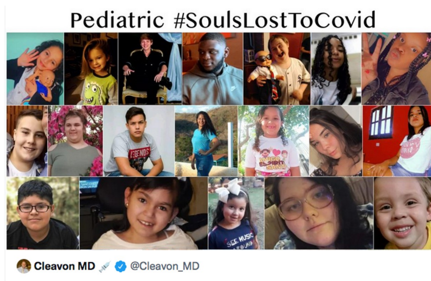
Some of the faces of children #SoulsLostToCovid

In South Dakota, a second child died from COVID-19 in the last two weeks. A boy between zero and nine years old from Minnehaha County succumbed on Tuesday, January 18. The previous week, a baby less than one year old from Pennington County died. The state has only recorded 27 cases of Omicron, yet has already lost two young souls.