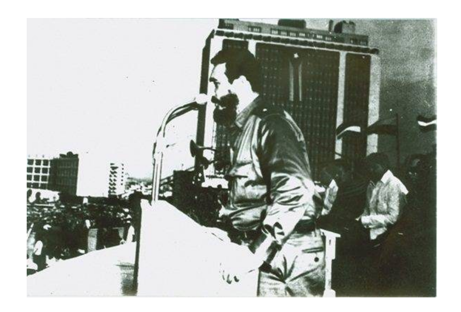
Fidel Castro announces the Second Declaration of Havana.

Read <u>the full appearance</u> of Fidel Castro Ruz before the press to explain to the people about the organization of the rally for the Second General Assembly of the People of Cuba, January 22, 1962, "Year of Planning".