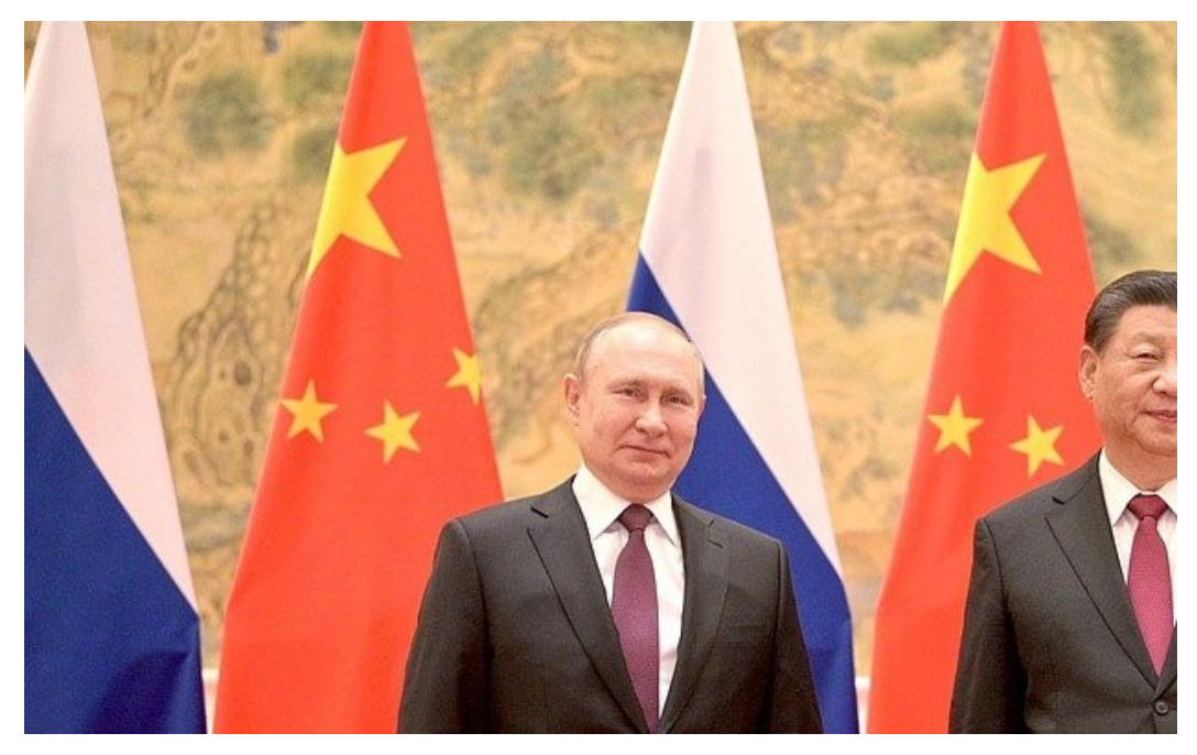
Sources: By Wereld Morgen [Photo: Putin and Xi (http://en.kremlin.ru/)]