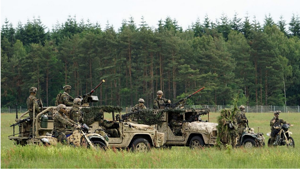
KSK unit at the Bundeswehr Day 2017

The Russian invasion of Ukraine has unleashed horror and fear of a third world war in broad sections of the German population. Those in ruling circles are reacting completely differently: behind their loud moral indignation and denunciation of President Putin lies a barely suppressed euphoria.