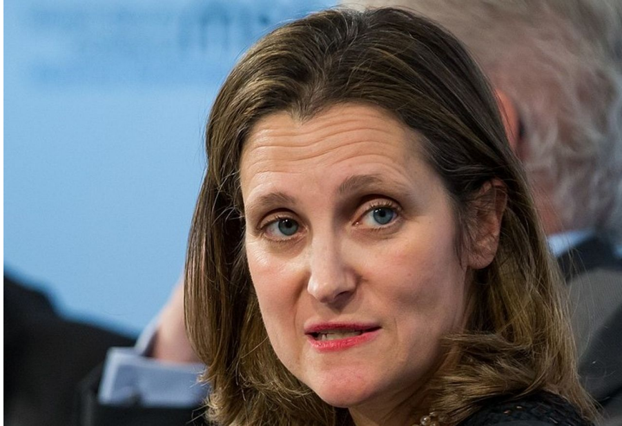
Canadian Deputy Prime Minister Chrystia Freeland

The National Post of Canada reported on March 2, 2022: