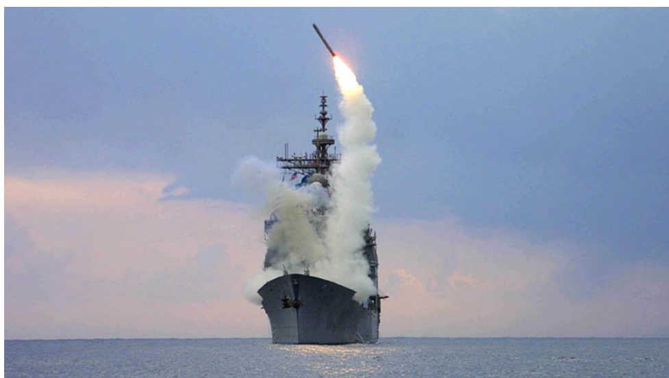
An American guided missile cruiser fires a tomahawk missile during the 2003 US invasion of Iraq

Like it or not, we are at war with the Serbian nation (the Serbs certainly think so), and the stakes have to be very clear: Every week you ravage Kosovo is another decade we will set your country back by pulverizing you. You want 1950? We can do 1950. You want 1389? We can do 1389 too. If we can frame the issue that way, Mr. Milosevic will blink, and we may have seen his first flutter yesterday.