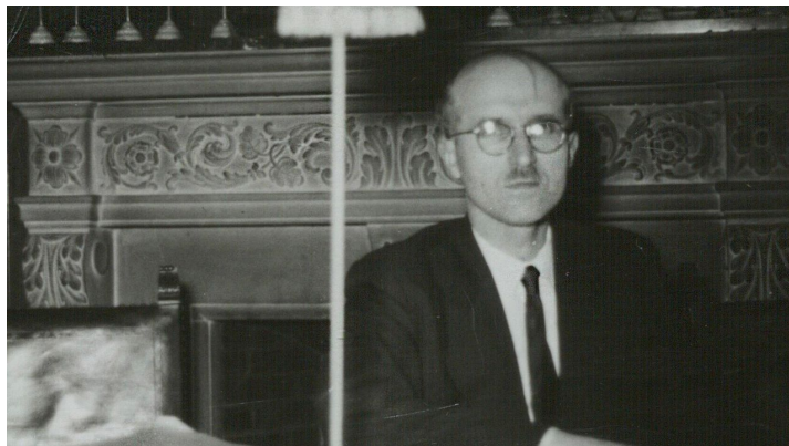
Yaroslav Stets'ko