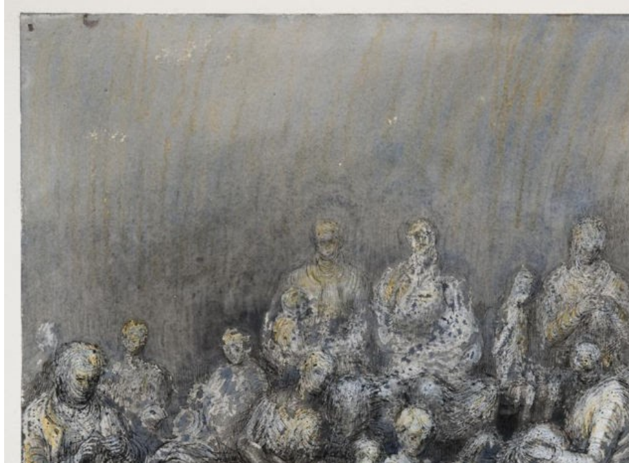
Henry Moore (Britain), Grey Tube Shelter , 1940.

It is hard to fathom the depths of our time, the terrible wars, and the confounding information that whizzes by without much wisdom. Certainties that flood the airwaves and the internet are easy to come by, but are they derived from an honest assessment of the war in Ukraine and the sanctions against Russian banks (part of a broader United States sanctions policy that now afflicts approximately thirty countries)? Do they acknowledge the horrific reality of hunger that has increased due to this war and the sanctions? It appears that much of the ‘certainties’ are caught up in the ‘Cold War mentality’, which views humanity as irreversibly divided on two opposing sides.