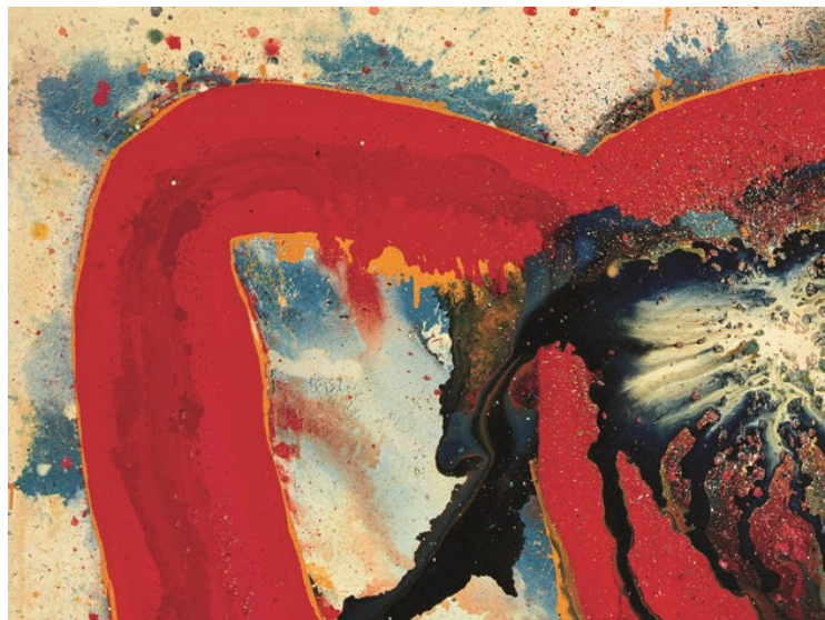
Sadamasa Motonaga (Japan), Red and Yellow, 1963.

Fearful of the great changes occurring in Eurasia, the US acted on commercial and diplomatic/military fronts. Commercially, the US tried to substitute European reliance on Russian natural gas by promising to supply Europe with Liquefied Natural Gas (LNG) from both US suppliers and Gulf Arab states. Since LNG is far more expensive than piped gas, this was not an enticing commercial deal. Challenges to Chinese advancements in high-tech solutions – particularly in telecommunications, robotics, and green energy – could not be sustained by Silicon Valley firms, so the US escalated two other instruments of force: first, the use of War on Terror rhetoric to ban Chinese firms (claiming security and privacy considerations) and second, diplomatic and military manoeuvres to challenge Russia’s sense of stability.