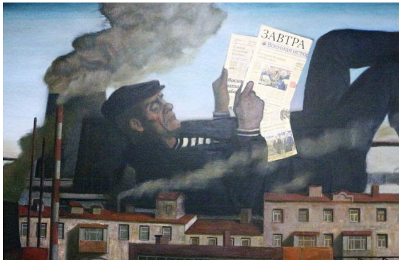
Evgeny Trotsky (Russia), Rest , 2016.

Russia indicated on several occasions that it was aware of these tactics and would defend its borders and its region with force. When the US intervened in Syria in 2012 and Ukraine in 2014, these moves threatened Russia with the loss of its two main warm water ports (in Latakia, Syria and Sebastopol, Crimea), which is why Russia annexed Crimea in 2014 and intervened militarily in Syria in 2015. These actions suggested that Russia would continue to use its military to protect what it sees as its national interests. Ukraine then shut down the North Crimean canal that brought the peninsula 85% of its water, forcing Russia to supply the region with water over the Kerch Strait Bridge, built at enormous cost between 2016 and 2019. Russia did not need ‘security guarantees’ from Ukraine, or even from NATO, but it sought them from the United States. There was fear in Moscow that the US would place intermediate range nuclear missiles around Russia.