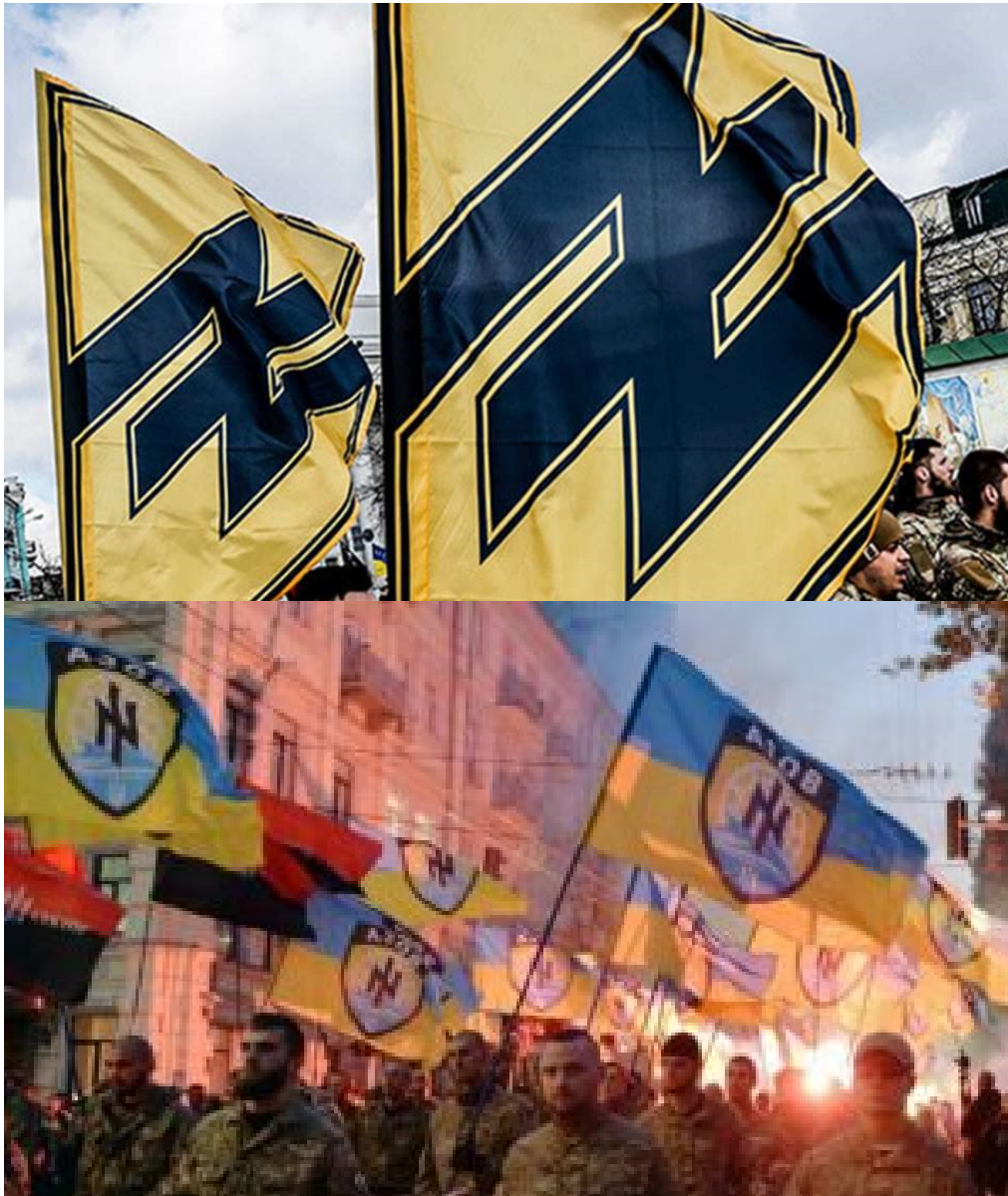
The Azov Regiment, linked to the Svoboda Party