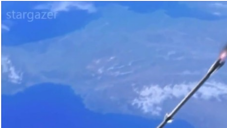
Rod from God.

The U.S. military has hinted that it will publicly unveil another secret space-based super weapon that is designed to wreak havoc on enemy satellites .