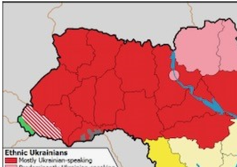
Ethno-linguistic map of Ukraine