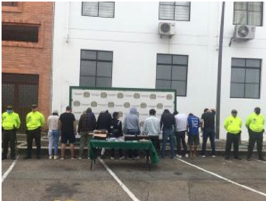
Captured members of the Front Line in Cali.

In effect, he put the Police and the Prosecutor's Office at the service of his obscurantist aims to carry out dozens of raids and arrest at least 20 young members of the popular resistance, whom he presented as "organizers of vandalism" and gave them a long list of absurd alleged crimes, which even the perpetrators of the arrests do not believe.