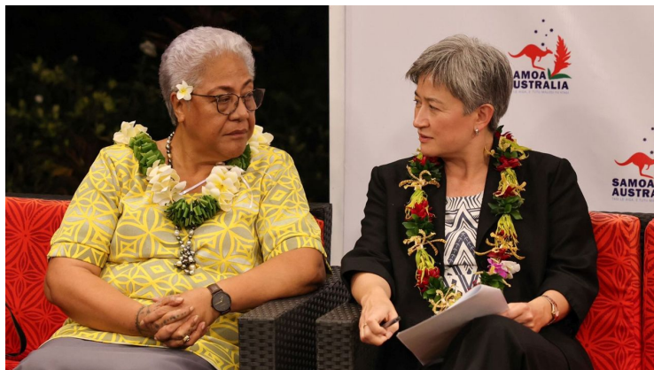
Samoan Prime Minister Fiaame Naomi Mata’afa with Australian Foreign Minister Penny Wong in early June 2022 (Image: Senator Penny Wong Facebook)

The PIF meeting follows a recent ten-nation tour of the region by Chinese Foreign Minister Wang Yi. The visit included the formalisation of a security deal with the Solomon Islands, prompting hysterical threats by Washington and Canberra of a possible “regime change” operation against the government of Prime Minister Manasseh Sogavare.