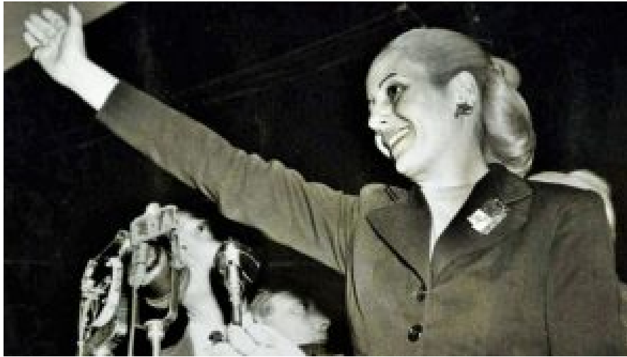
Eva Duarte de Perón (1919-1952).

thwarted if Evita had been alive. I know this is just a guess, but there are many arguments with which to validate this hypothesis.