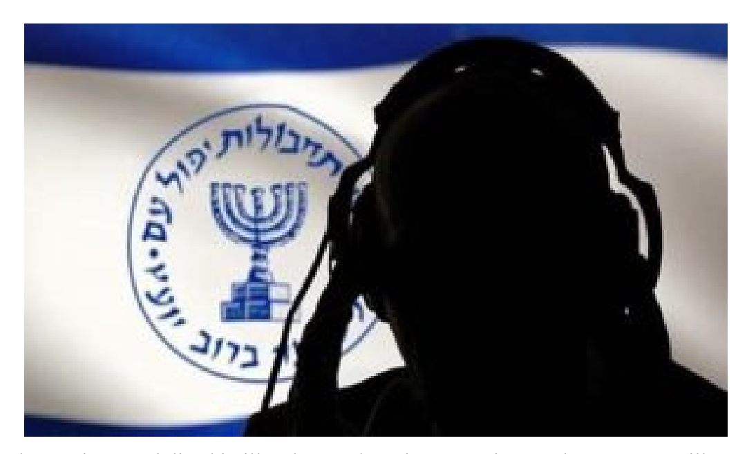
The Neviot, specialized in illegal eavesdropping operations and remote surveillance technology management.

the beginning of a confrontation" and that his organization "will not hesitate to go to war" if Israel extracts the gas before the dispute is resolved.