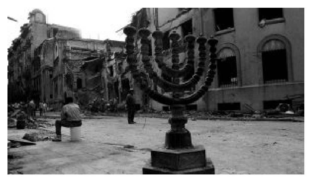
On March 17, 1992, the Israeli Embassy in Buenos Aires suffered an attack that caused 22 deaths.