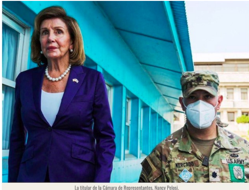
La titular de la Cámara de Representantes, Nancy Pelosi.