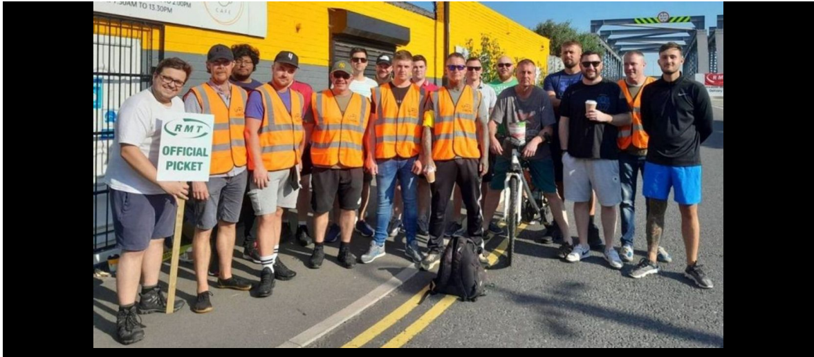
Striking rail workers on the picket line at Doncaster Marshgate depot in South Yorkshire, England during June's three day strike

This time, however, a “palace coup” may not be enough to save the Tories. Throughout the summer, the UK has seen the broadest wave of industrial action since the 1980s, involving hundreds of thousands of workers. The key role in policing and suppressing these struggles has been played by the trade unions, which, by rigorously separating the strikes by different groups of workers, even in the same industry, such as rail, and a seemingly endless round of balloting of the largest groups of workers in education and the National Health Service, have so far kept this from developing into a combined offensive involving millions.