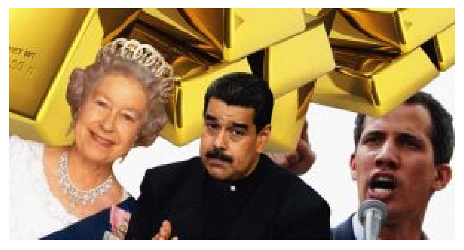
Letters signed by Queen Elizabeth II contradict British ruling on stolen gold