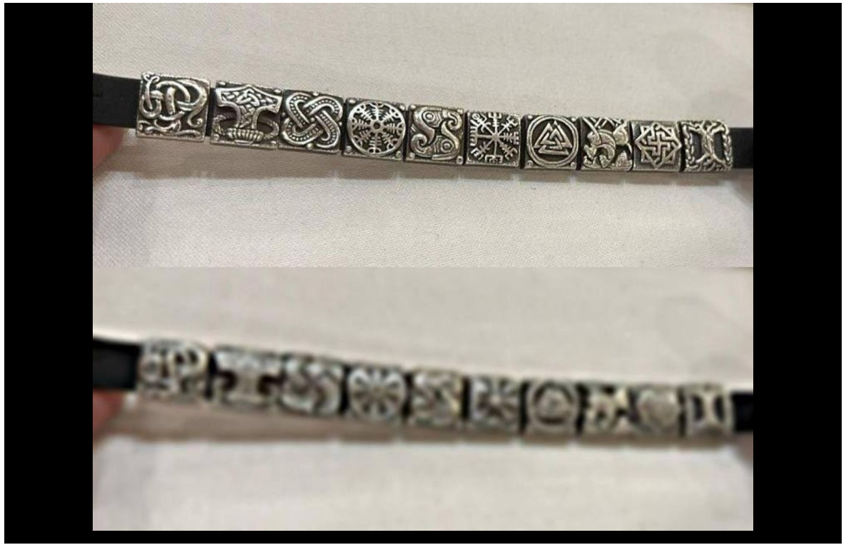
The "Viking" bracelet Zaluzhnyi was wearing.

In one photo widely circulated on Twitter which was Zaluzhnyi's own account posted, he can be seen walking with a gun while wearing a bracelet adorned with far-right symbols, including one symbol resembling a Nazi swastika. The bracelet is sold as a "Viking" bracelet in Ukraine and contains a number of symbols that are associated with Norse mythology and employed by far right and neo-Nazi movements worldwide.