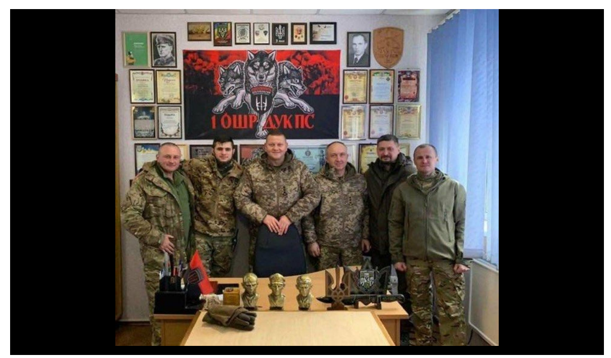
Zaluzhnyi with soldiers in an office, decorated with busts and portraits of Stepan Bandera and other Ukrainian fascists.

Supporters of the NATO-backed proxy war in Ukraine on Twitter and Western media outlets such as France24 have attempted to whitewash Zaluzhnyi's choices of decoration by pointing out that the swastika on the bracelet is not as prominent as it appears in Zaluzhnyi's Twitter photo. Zaluzhnyi has been depicted as a heroic figure in the Western pro-imperialist press and has even recently appeared on the cover of Time magazine. To acknowledge the role of far-right forces within Ukraine is tantamount to heresy within the corporate press, since it would expose the real character of the imperialist-backed war in Ukraine.