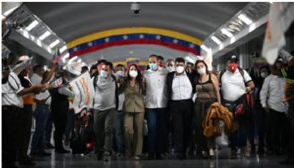
Embrasur. Return Venezuela crew.

Alex Saab is a Venezuelan diplomat who was on a mission to combat blockade measures in order to obtain supplies of food, medicine and fuel from allied countries. During a stopover in Cape Verde and on orders from the United States, he was illegally detained in June 2020, imprisoned and tortured. Despite his status as a diplomat, the United States imposed on Cape Verde the surrender of this diplomat in October 2021, which according to international laws and conventions is a real kidnapping. Alex Saab is currently imprisoned in the United States although the US justice has withdrawn 7 of the 8 charges against him).