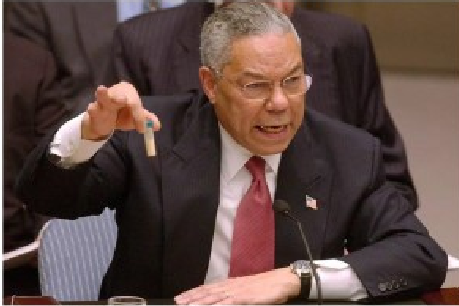
■ Colin Powell devant le Conseil de sécurité des Nations unies, le 5 février 2003.

Colin Powell before the United Nations Security Council, 5 February 2003. Elisa Amedola In Europe, statistics reveal that by majority the people do not trust their big media, but the popular expression of "Info or intox?", for information or intoxication, went out of fashion.