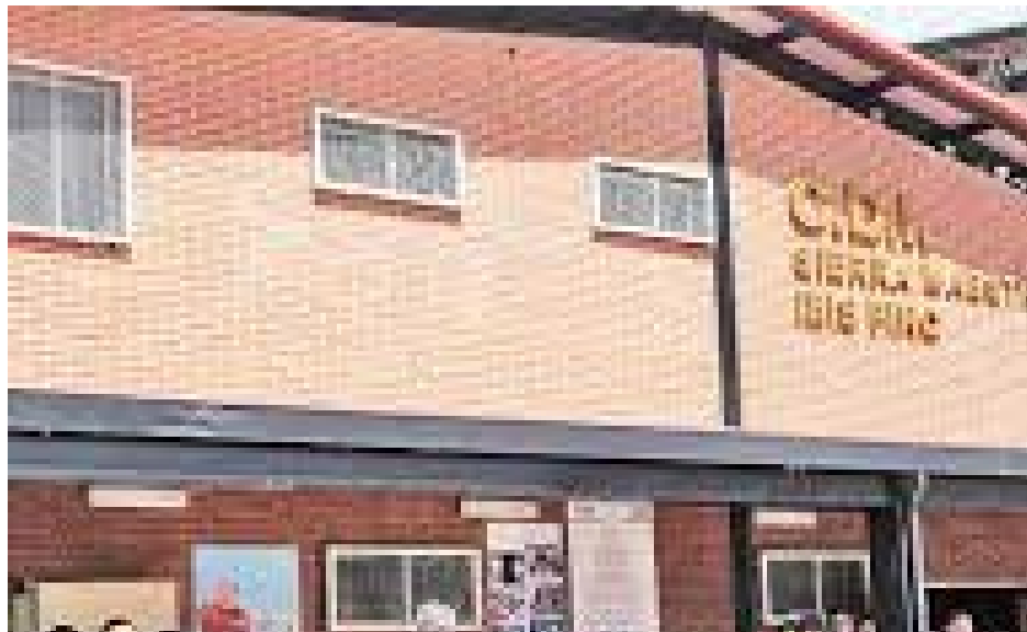
Diagnostic and Guidance Centers (CDI)