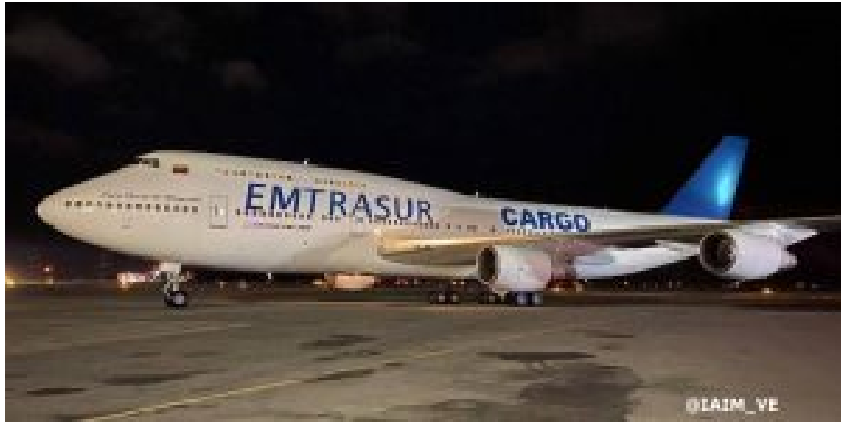
The 747 Emtrasur kidnapped