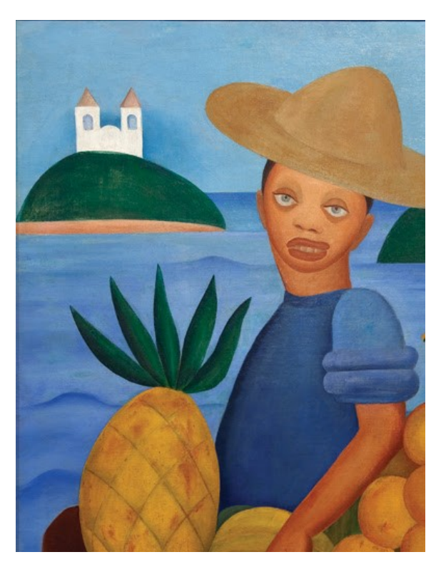
Tarsila do Amaral (Brazil), O Vendedor de frutas ('The Fruit Vendor'), 1925.