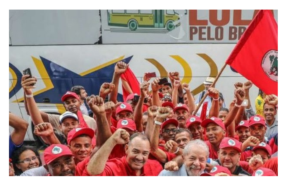
Ricardo Stuckert, Lula visits the MST in Espírito Santo, 2020.

Today, humanity is at risk because of senseless social inequality, attacks on the environment, and an unsustainable consumption pattern in rich countries that is imposed on us by capitalism and its profit-seeking mentality.