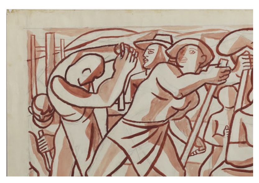
Emiliano Di Cavalcanti (Brazil), Projeto de Mural ('Mural Project'), 1950.

We will always fight to save lives and our planet, to live in solidarity and in peace with social equality, emancipated from social injustices, exploitation, and discrimination of all kinds.