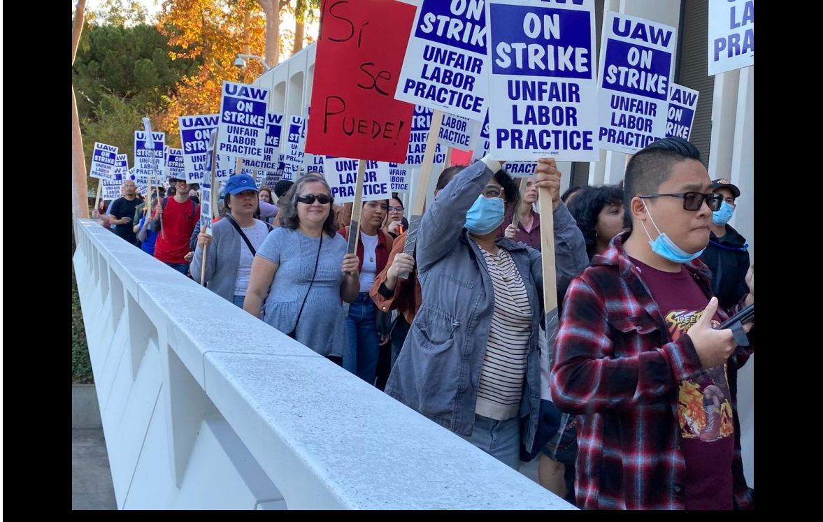
Strikers at UC Irvine

As the powerful strike of 48,000 University of California (UC) workers nears the end of its first week, striking workers are expressing their determination to end poverty wages in one of the most expensive regions in the world.