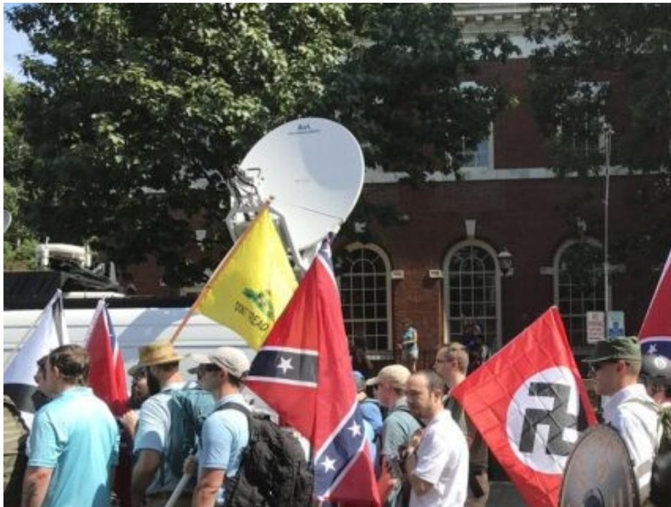
Photo: Neo-Nazi rally in Charlottesville in 2017

After the deadly performance of neo-Nazi groups in Charlottesville in 2017 Trump as president spoke of " people very good " among the protesters. Under his tenure, there was never any problem. with openly racist statements or displays of hatred towards women.