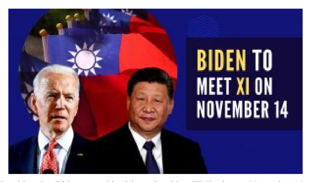
U.S. President Joe Biden met with Chinese President Xi Jinping on November 14 on the sidelines of the Group of 20 Summit in Bali, Indonesia

These facts have apparently been fundamental – but not unique – factors in the decision of the Taiwanese to give a resounding defeat to the ruling Democratic Progressive Party (PDP) in the municipal elections last Sunday, November 27.