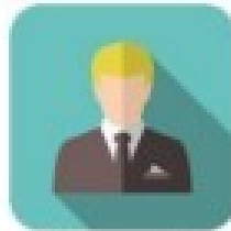
A. The communist

Thinks Russia is still communist, & is standing up for the little guy against the evil corporate west. Has absolutely no grasp of the reality of the modern world. Denser than a neutron star.