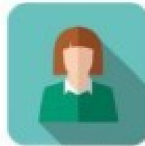
B. The lefty antifascist (subtype of A)

Thinks Russia is still communist, & is standing up for the little guy against the evil corporate west. Has absolutely no grasp of the reality of the modern world. Denser than a neutron star.