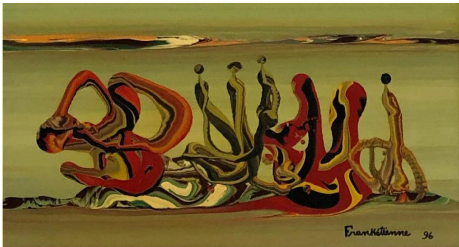
Frankétienne (Haiti), Silhouettes , 1996.

All of this goes back to the refusal of the imperialists to ever allow Haiti to breathe – they could never forgive the fact that Haitians were the first people in the world to lead a successful revolution against imperialism.