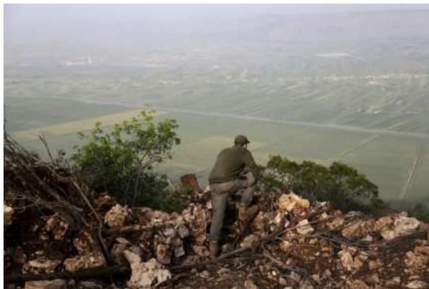
A rebel fighter stands on a hill overlooking al-Ghab plain, as he monitors the progress of the fighting from the Jabal al-Akrad area in Syria's northwestern Latakia province

Field sources told the daily that an unprecedented number of troops was being massed on the northern fronts adjacent to all of the militant positions from rural Hama to the Al-Ghab Plain and southern rural Idlib.