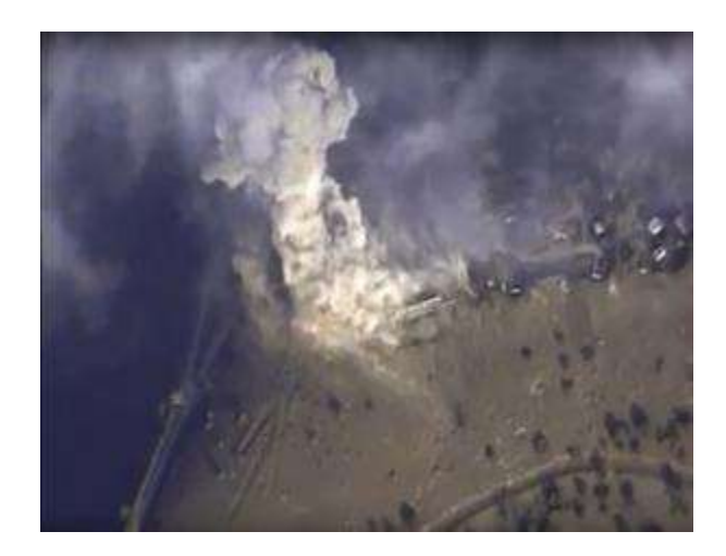
This file photo made from the footage taken from Russian Defense Ministry official web site

The wheels are in motion for a process that could possibly usher Assad out. Foreign ministers of 19 countries met in Vienna after the Paris attacks and set a Jan. 1 deadline to start negotiations between Assad's government and opposition groups for ending a conflict that has killed more than quarter of a million people. Diplomats hope to have a transitional government six months later, with U.N.-supervised elections within 18 months, although previous efforts have failed.