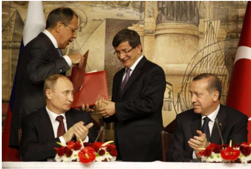
Putin and Turkish President Recep Tayyip Erdogan, right, with Foreign Minister Sergei Lavrov of Russia, left, and Prime Minister Ahmet Davutoglu of Turkey.

Russia has accused Turkey of facilitating the Islamic State's rise by purchasing oil stolen and produced by the jihadist group in Syria.