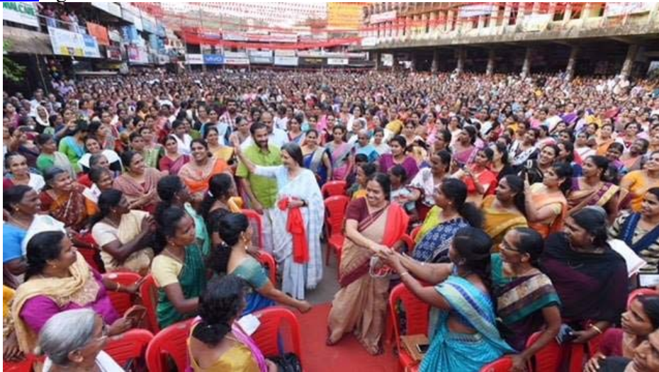
Women's Parliament in Palghat, Kerala, in support of the Left Democratic Front, 12 March 2019.

Venezuela has made its bet on the shift from a uni-polar to a multi-polar world order. Close observation of the developments here are essential, for they will tell us how much the needle has moved away from US domination of world affairs towards a fragmentation of power. But this fragmentation, this multipolarity will not emerge fast enough. It will take its time. Time is something that new social experiments do not have. They are attacked before they can breathe. That is my assessment of the socialist experiment in Venezuela. It has not been given enough time to overcome the penalties of the colonial and oligarchic past. The Venezuelan people must not only fight to defend their revolution, but they must also fight to overcome the burdens of the past (such as a lack of economic diversity, enforced by the old oligarchy). That was the theme of an interview I gave in Caracas earlier this month.