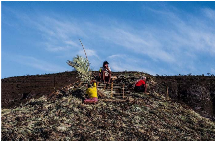
Xavante (Mato Grosso). Photo from the XVIII Meeting of Traditional Cultures in Chapada dos Veadeiros (2018) by Evna Moura

Disobedience to US positions seems to be rising. Turkey, a NATO ally of the US, has refused to give up its Russian S-400 missile system. Turkey's disregard for US demands is not a sign that Turkey's government has in any way shifted its far right orientation, merely that this is a signal of the fraying of US authority (all the more of interest given Turkey's deep internal economic problems, as laid out by E. Ahmet Tonak of Tricontinental: Institute for Social Research ). Italy, a member of the European Union and of the G-7, will not only open up its ports to the Chinese-led Belt and Road Initiative – including the port of Genoa – but it will develop the ports with China Communications Construction and COSCO, both state-run ventures. Fears of Chinese control over the Mediterranean ports (it also has a project in Greece) have set off alarms in Europe. Europeans are quite prepared to insert themselves all over the world but are uncomfortable when the tables are turned.