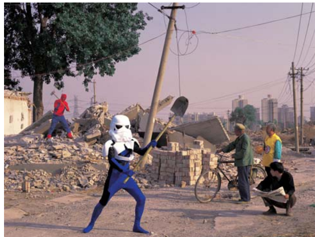
Housebreaker , Cao Fei, 2004.

Iraq cannot afford to be the marionette of the United States. It has its own history and its own geography. This week, defence chiefs from Iran (Mohammed Baqeri), Iraq (Othman al-Ghanimi) and Syria (Ali Abdullah Ayyoub) met in Damascus (Syria) to consider what the US departure from Syria will mean for the region. Iraq has opened the al-Qaim border crossing to allow goods – including Iranian goods – into Syria. This will form a vital part of Iran's plans for the reconstruction of Syria. That Iraq refuses to stop buying Iranian oil has meant that the US government was forced – to save face – into offering Iraq another waiver to circumvent the US sanctions on Iran. Iranian President Hassan Rouhani went to Iraq to settle plans for the building of a rail connection that will run from Iran's Shalamchah border crossing through Iraq and to the Syrian port of Latakia. This is part of the Iranian sector of the Chinese-led Belt and Road Initiative.