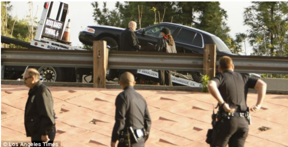
LAPD officers watch from the Canoga Avenue on a ramp to the closed southbound Ventura 101 Freeway in Woodland Hills early this morning as a tow truck lifts the Ford Crown Victoria former police car driven by Arian

http://www.dailymail.co.uk/news/article-2129203/8-LAPD-police-officers-shoot-kill-unarmed-man-19-90-rounds-dramatic-car-chase-caught-live-TV.html#ixzz1tGR5gm5Q Read more: