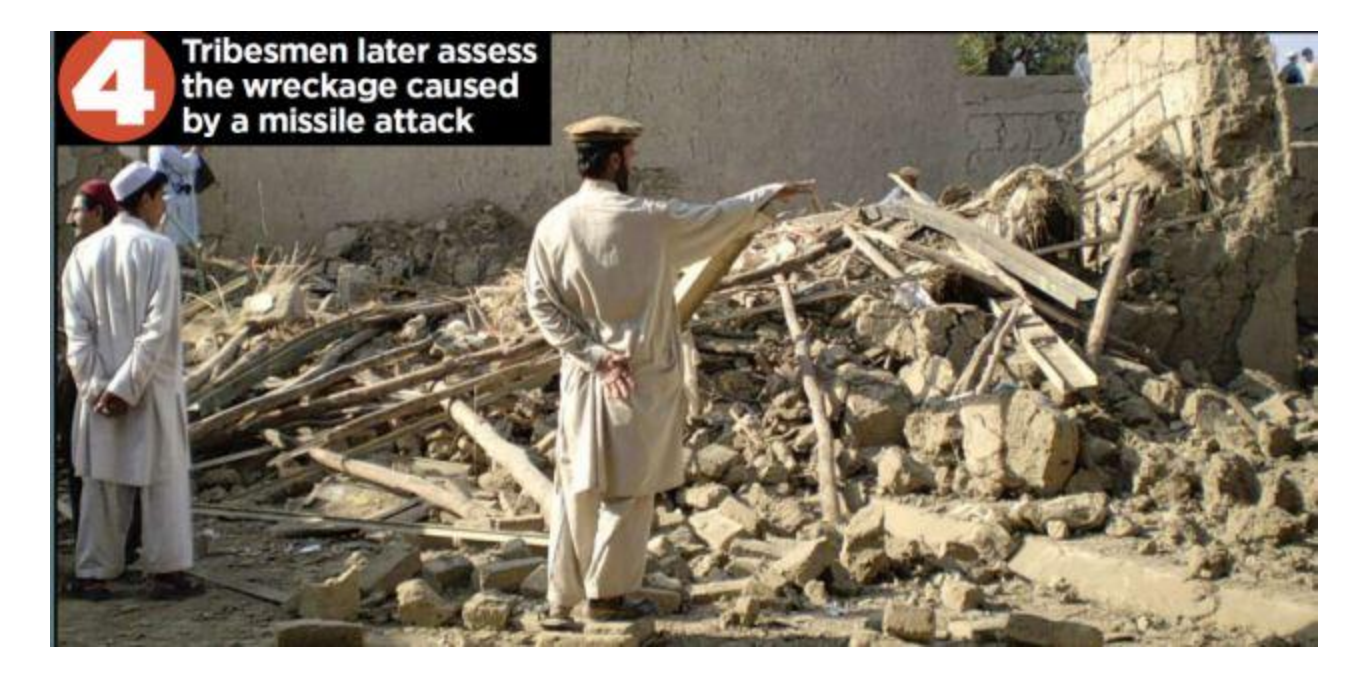
'We have statements from a further 82 victims' families relating to more than 30 drone strikes,' he said. 'This is their only hope of justice.'