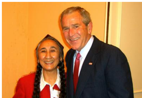
Image: Head of the World Uyghur Congress, millionaire Rebiya Kadeer with George W. Bush.

The US goes to any length to support the Uyghur separatists abroad, for instance the World Uyghur Congress headed by Rabiya Kadir , one of the richest Chinese in the world... She meets US congressmen and even has had a meeting with George Bush. She is a hyped symbol of Uyghur resistance. The 10 Conditions of Love movie devoted to her was shot in 2009. Despite the protests from Beijing, it was included into the Melbourne festival's program.