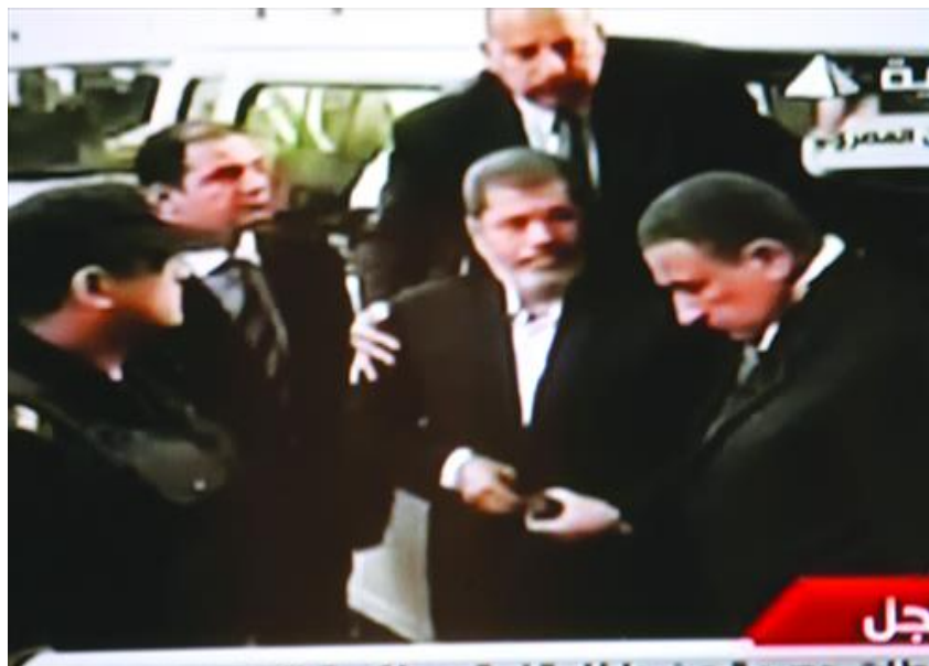
A video broadcast image shows ousted President Mohammed Morsi (center), arriving for a court hearing in Cairo, November 4

To answer the ongoing political conundrum facing Egypt, Global Times reporters interviewed local scholars, diplomats, civilians, as well as Chinese businesspeople to gauge the reality of the situation before a new government is formed.