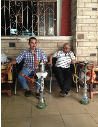
Two Egyptians enjoy shisha tobacco at a cafe in the Giza area in Cairo