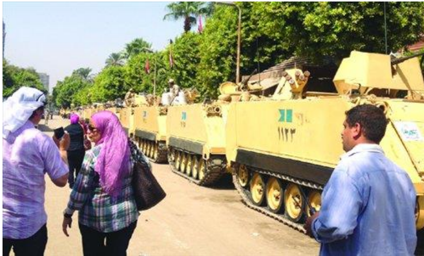
People walk past a line of tanks on September 21 in downtown Cairo.

Egypt has been ruled by an interim government since July 3, when its first democratically elected president Mohamed Morsi was ousted. The former president has been put on trial on November 4, though the court trial was repeatedly interrupted by him and postponed until January.