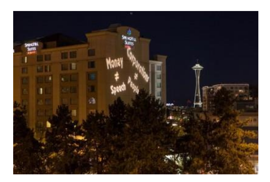
Rolling Rebellion Hits Two Key Foundations of Corruption of Government.

Just as the Bill of Rights in the US Constitution came from the experience of that era, where colonists experienced abusive searches, unfair trials, lack of due process and the monarchy curtailing their freedoms of speech and assembly, a constitution written today would reflect the challenges of our era. The Spanish put forward basic principles which "inspire a new, robust Bill of Rights" which include universality and diversity, equality, guaranteed democratic infrastructure and financial sufficiency. They conclude,