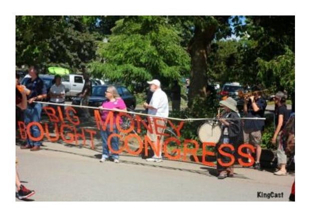
Rolling Rebellion Seattle 'Big Money Bought Congress' by CastKing

People around the world are thinking seriously about how to create real democracy, where the people rule their own lives. An American academic currently living in Italy, Steven Colatrella, has written a first draft of a new constitution that does away with nation-states and creates world governance by a series of what he calls Cosmopolis governments. The goal is: "A Civilization based on Self-Governing Cities and Townships, Cooperative Self-Governed Workplaces and Public Finance, Sustainable Agriculture and Renewable Energy and Universal Access to Citizenship, Income and Subsistence." He hopes to start a conversation about this, so review his article and constitution and share your comments.