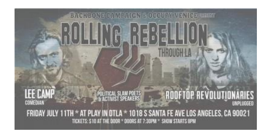
In Los Angeles, Rolling Rebellion held a democracy performance