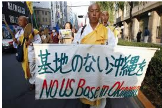
Peaceful protestors, Japan.

In the war game China then attempts to launch a retaliatory strike with its tens of nuclear missiles capable of hitting the west coast of the continental US. But US “missile defense” systems, currently deployed in Japan, South Korea, Australia, Guam and Taiwan, help take out China’s disabled nuclear response.