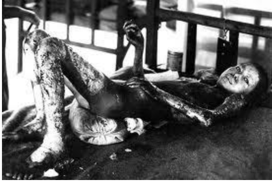
Victim of US nuclear weapons: Hiroshima, 1945.

A full-blown arms race between the US, Russia and China will be a disaster for the world and would make life on Earth less secure. At the very time that global resources are urgently needed to deal with the coming harsh realities of climate change and growing poverty, we can hardly afford to see more money wasted on the further militarization of space and greater superpower conflict.