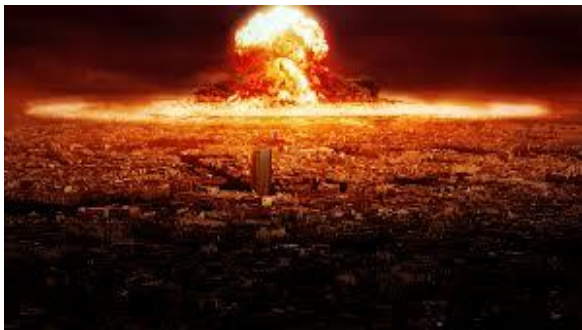
Image: UK Ministry of Defence warns of new technologies' potential to trigger a 'doomsday scenario'

As the US undertakes arming the world to the benefit of corporate globalization our local communities have become addicted to military spending. As we oppose the aggressive US military empire overseas we must also talk about the job issue back at home. Calling for conversion of the military industrial complex, demanding that our industrial base be transformed to create a renewable energy infrastructure for the 21 st century, helps us come into coalition with weapons production workers who must now support the killing machine if they hope to feed their families.