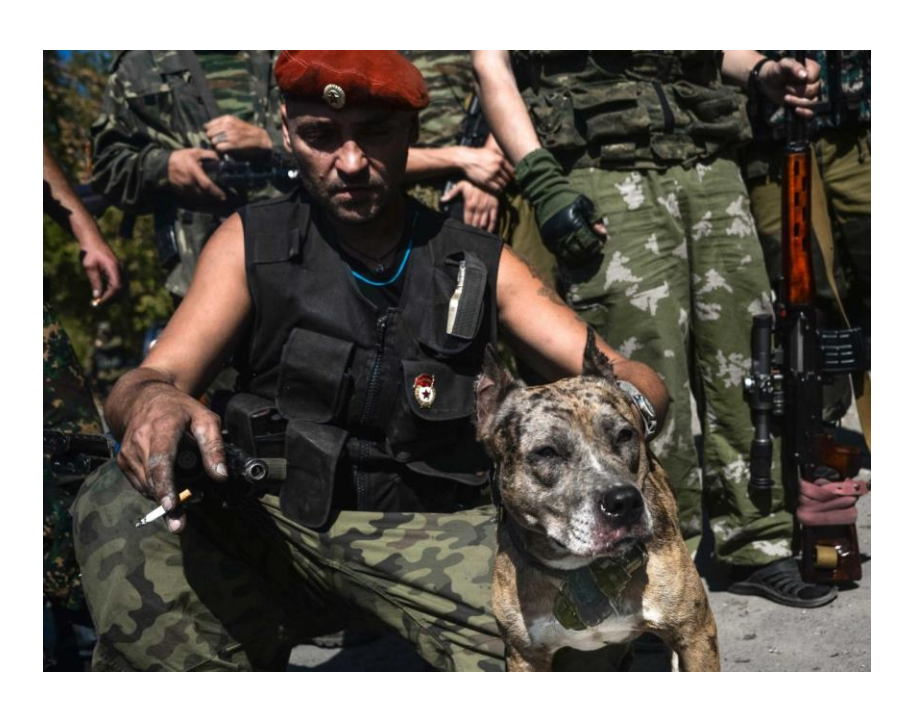
A Pro-Russian rebel holds a dog named Devka with hand grenade attached to the leash in Donetsk, eastern Ukraine.