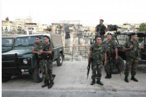
Image: Lebanese army ready to defend Tripoli

“So what?” many people in the region would ask, including those living in Lebanon.