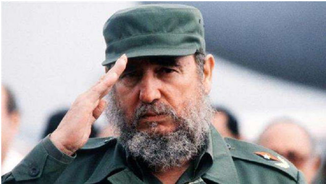
Cuba's late revolutionary leader Fidel Castro