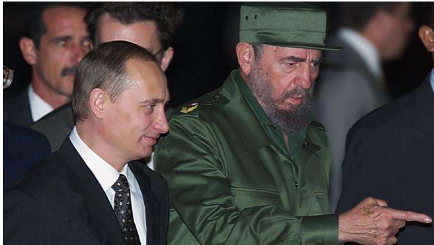
The file photo taken on December 13, 2000, shows Cuban President Fidel Castro, right, welcoming Russian President Vladimir Putin at the Jose Marti Airport in the Cuban capital, Havana.

Russian President Vladimir Putin praised Castro as "the symbol of an era" on Saturday.