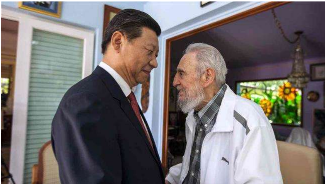
China's President Xi Jinping, left, greets Fidel Castro in Havana, Cuba, July 2014.

China's President Xi Jinping said in reaction to the death of Cuba's iconic former president that the "Chinese people have lost a close comrade and a sincere friend."