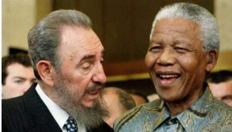
The file photo shows Cuban revolutionary leader Fidel Castro, left, with South African leader Nelson Mandela at the 50th anniversary of the GATT Agreement in 1997. Namibia

The Nelson Mandela foundation conveyed its “deepest condolences” to the Cuban people and government “on passing of Fidel Castro.” It also shared a photo on Twitter showing Castro with South Africa's late leader Nelson Mandela.