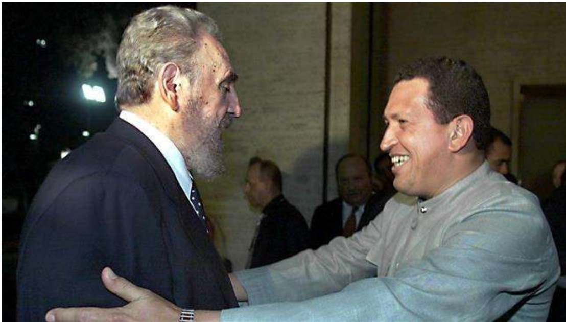
Venezuela's late President Hugo Chavez, right, meets Cuba's revolutionary leader Fidel Castro in Rio de Janeiro, Brazil, June 29, 1999.

Venezuelan President Nicolas Maduro conveyed his condolences to the Cuban people over the death of Castro.