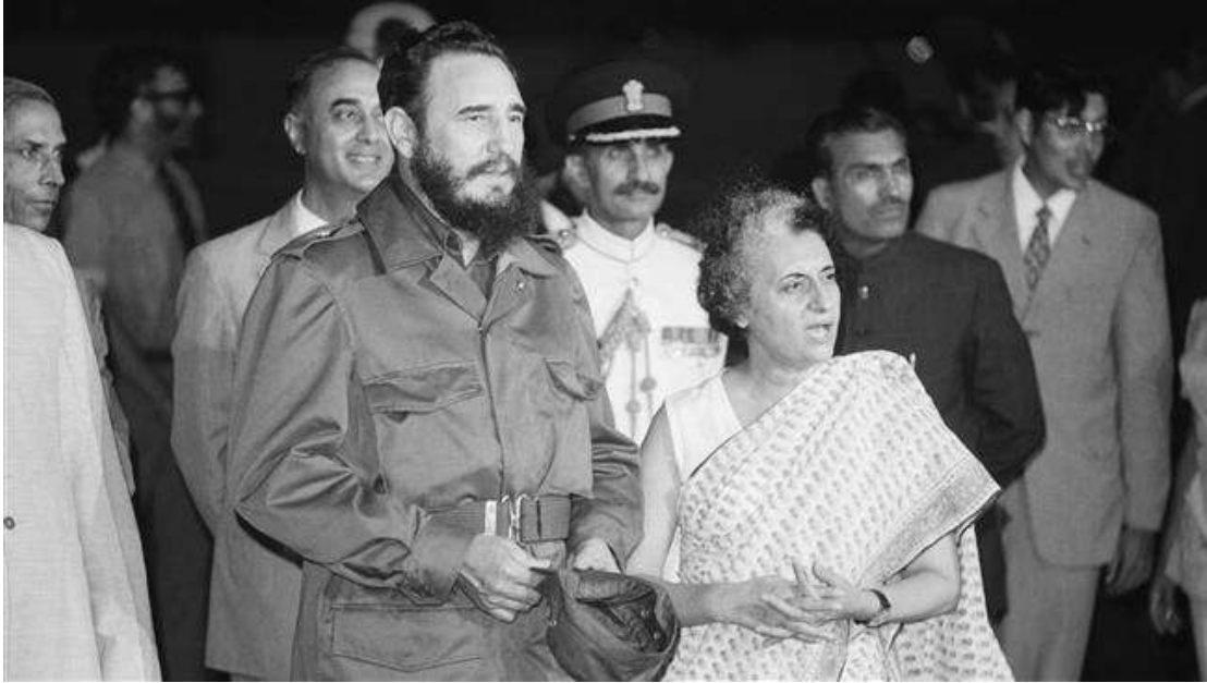
The file photo shows Cuban revolutionary leader Fidel Castro, center left, being welcomed by Indian Prime Minister Indira Gandhi at the airport in the Indian capital, New Delhi, in 1983, when Castro came to attend the 7th Non-Aligned Summit.

Modi said his country “mourns the loss of a great friend.”