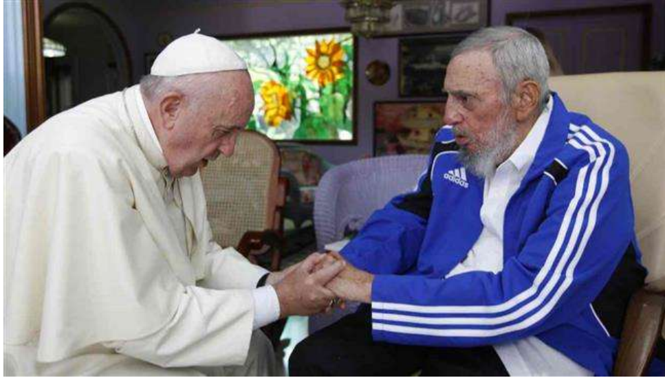
Pope Francis, left, and former Cuban President Fidel Castro meet in the Cuban capital, Havana, September 20, 2015.

In a message to Castro's brother, Raul, Pope offered his "sense of grief to your excellency and family."