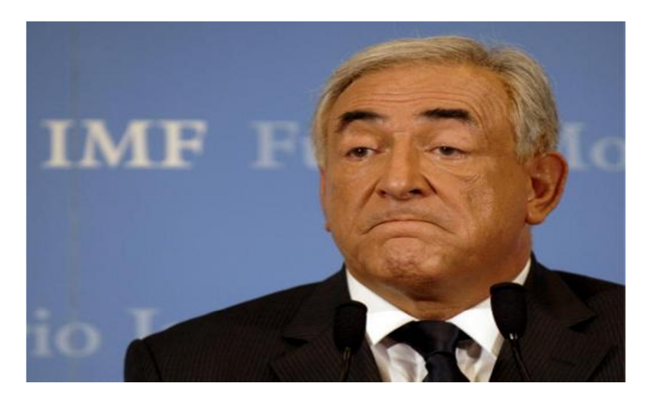
Blocking Strauss-Kahn, the Presidential Candidate

The demise of Strauss-Kahn potentially serves to strengthen the hegemony of the US and its control over the IMF at the expense of what former Defense Secretary Donald Rumsfeld called "Old Europe".